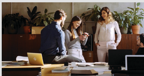
WHAT YOU SEE