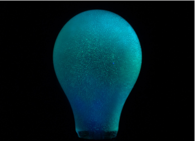
PAX-100 ELECTROSTATIC SPRAYER

Pax Innovations a Unimanix Industries Brand